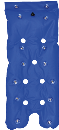
BS1301 back view